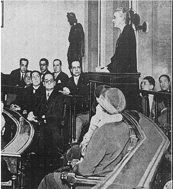
Madame Curie at the Brazilian National Academy of Medicine, photograph of Revista da Semana , August 28, 1926.

The work of the great scientist Maria Skłodowska-Curie, holder of two Nobel prizes, is well known. A lesser known fact is the passage of this illustrious scientist in Brazil, for a period of 45 days. Also, in 2011, we participated in a work that addressed Maria Curie's visit specifically to the city of Belo Horizonte, state of Minas Gerais, and the results of the research brought even more motivation for us to continue seeking to know the marks that this wonderful woman had left in Brazil. The topic received additional motivation in 2017, in which the 150th anniversary of the birth of Maria Skłodowska-Curie was celebrated, resulting in the book “A visita de Marie Curie ao Brasil” (Maria Skłodowska-Curie w Brazylii).